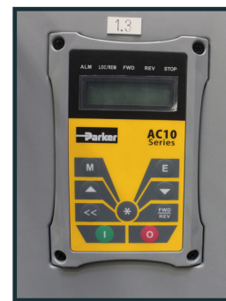
Electronic Phase Converter by Parker