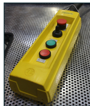
Remote control for start, stop, stepless speed control for sensitive operations