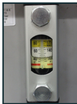
Temperature, Pressure and Filter indication